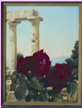
Roses and Temple, Patrick Hennessy Crunchy Praline Cookie with White Chocolate & Orange Mousse and Marzipan Roses