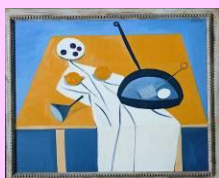
Frying Pan, Funnel, Eggs & Lemons, William Scott Lemon Tart with Vanilla Crème Fraiche