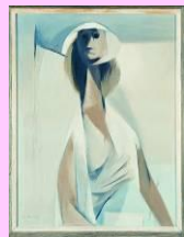
Woman in White, Louis le Brocquy Chocolate and Star Anise Macaroon