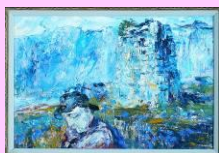
Defiance 1950, Jack B Yeats Mixed Berry Bavaois with Cinnamon Brioche